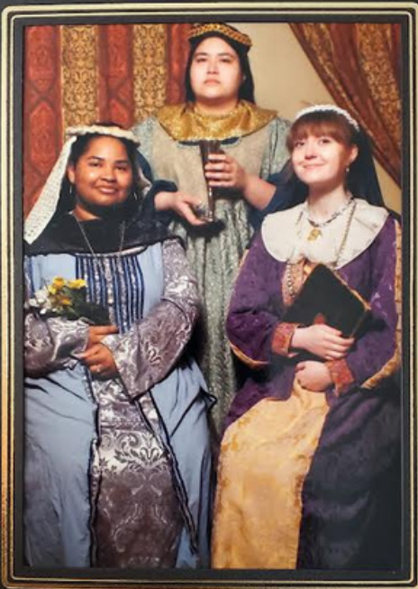
My friends and I took a picture at a Renaissance Fair during summer vacation

This month's recommended song is: Thee Sacred Souls- Live For You