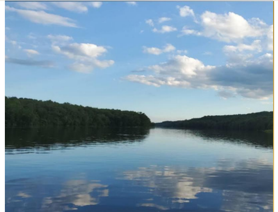
The river in my hometown

Anyways, I also hung out with my friends a lot as well as going out and swimming in the river. When I was younger, my family and family friends would go camping on the river. It was a lot of fun, and I was always allowed to invite one of my friends