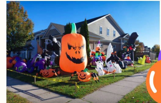
Halloween yard decorations in the U.S.

Halloween isn't such a big holiday in Japan. Maybe in recent times, places like Tokyo or Osaka (places that attract many tourists) have different Halloween events or parties. Out in the countryside of Japan, however, Halloween isn't such a big event. Of course, there are some houses and stores that decorate with little knick-knacks or have some streamers, but that's about it.